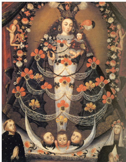
Our Lady of Pomata 1700–50 Peru, Cuzco School Oil on canvas, 26 x 21 inches