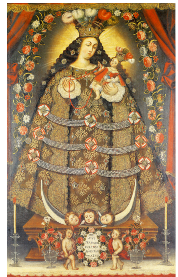
Virgin of Pomata (Virgin of Pomata) 17 th Century, Anonymous, Bolivia Oil on canvas, 183 x 115.5 cm Museo Nacional de Arte, La Paz