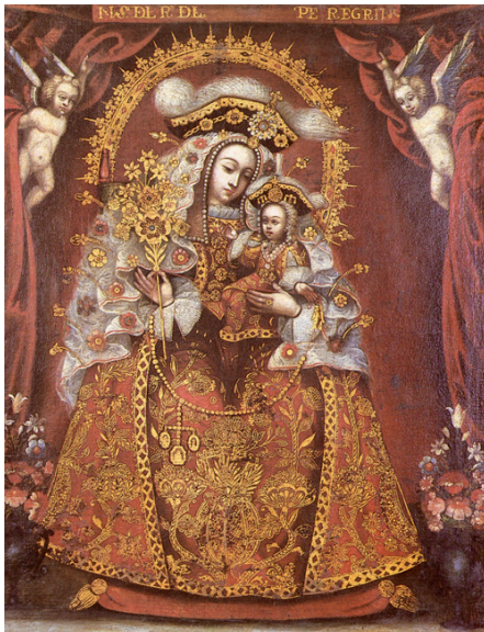
Virgin as Pilgrim ca. 1733, Anonymous, Peru, Lima School Oil on canvas 32 3/4 x 25 1/4 inches Private Collection Lima